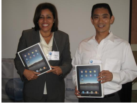
The top prize winners with their new Apple iPads