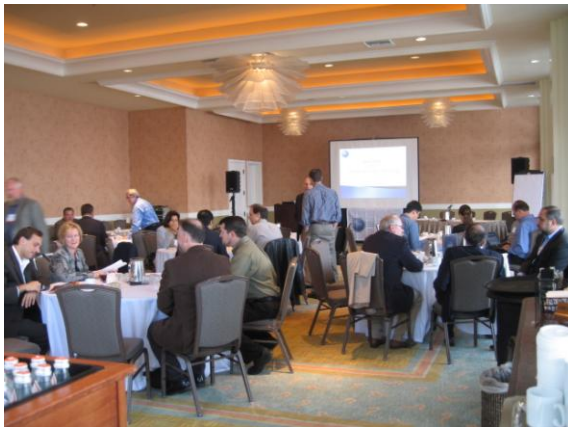
The elegant conference room.....