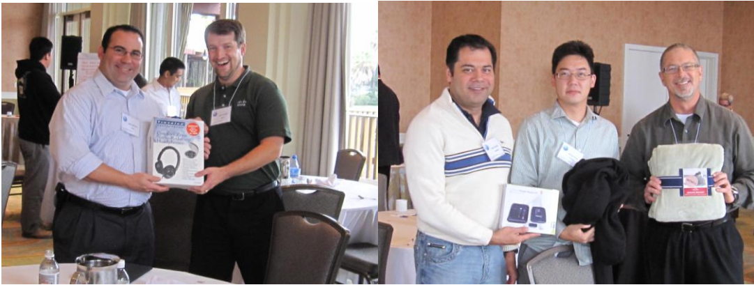
No one left empty handed...some more happy members with their prizes!