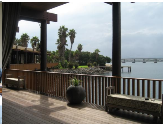
and what a view!