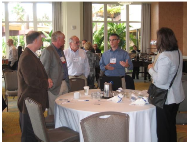
TSANet Member Meetings – always a great networking opportunity!