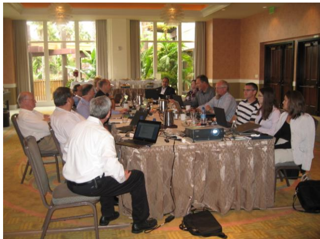
TSANet Board and Staff meet in San Diego

The TSANet Board(s), Utah/Delaware, took the opportunity of the Members Meeting to arrive a day early for a face to face Board meeting. As always there was a full agenda to work through, while the Boards meet regularly throughout the year via conference call meetings everyone agreed that much was achieved by being "face to face". It was also possible to fine tune the agenda and presentations agreed for the Members Meeting to take place on the following two days.